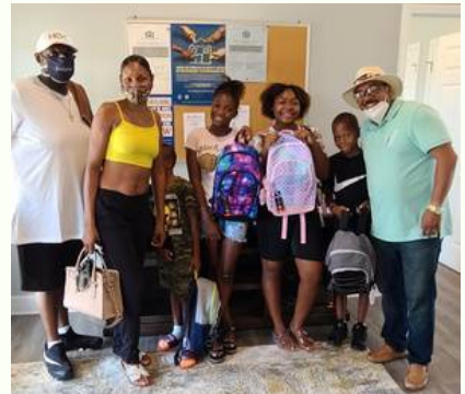
NLR Family at Pine Crossing North Little Rock, AR 08.12.2021